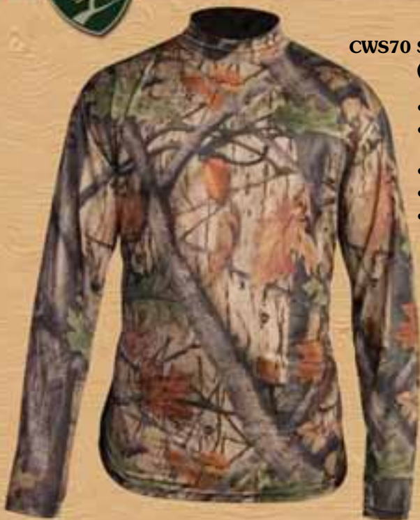
CWS70 SCENTRAP® BASE LAYER SHIRT (WOOD'N TRAIL®)