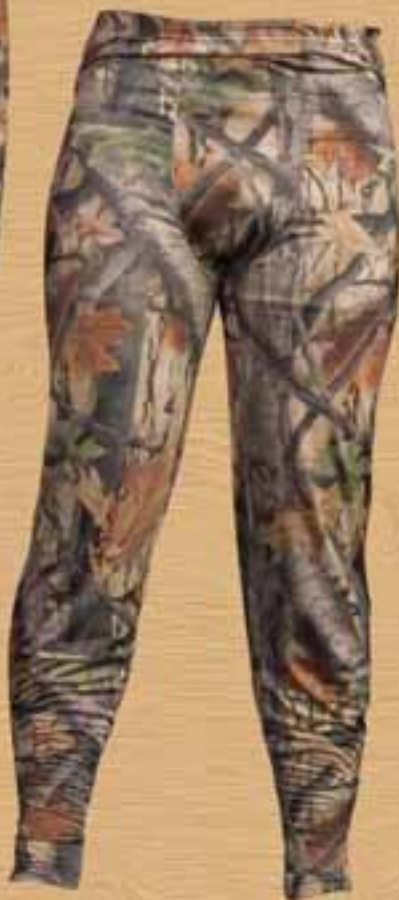
CWS71 SCENTRAP® BASE LAYER PANT (WOOD'N TRAIL®)